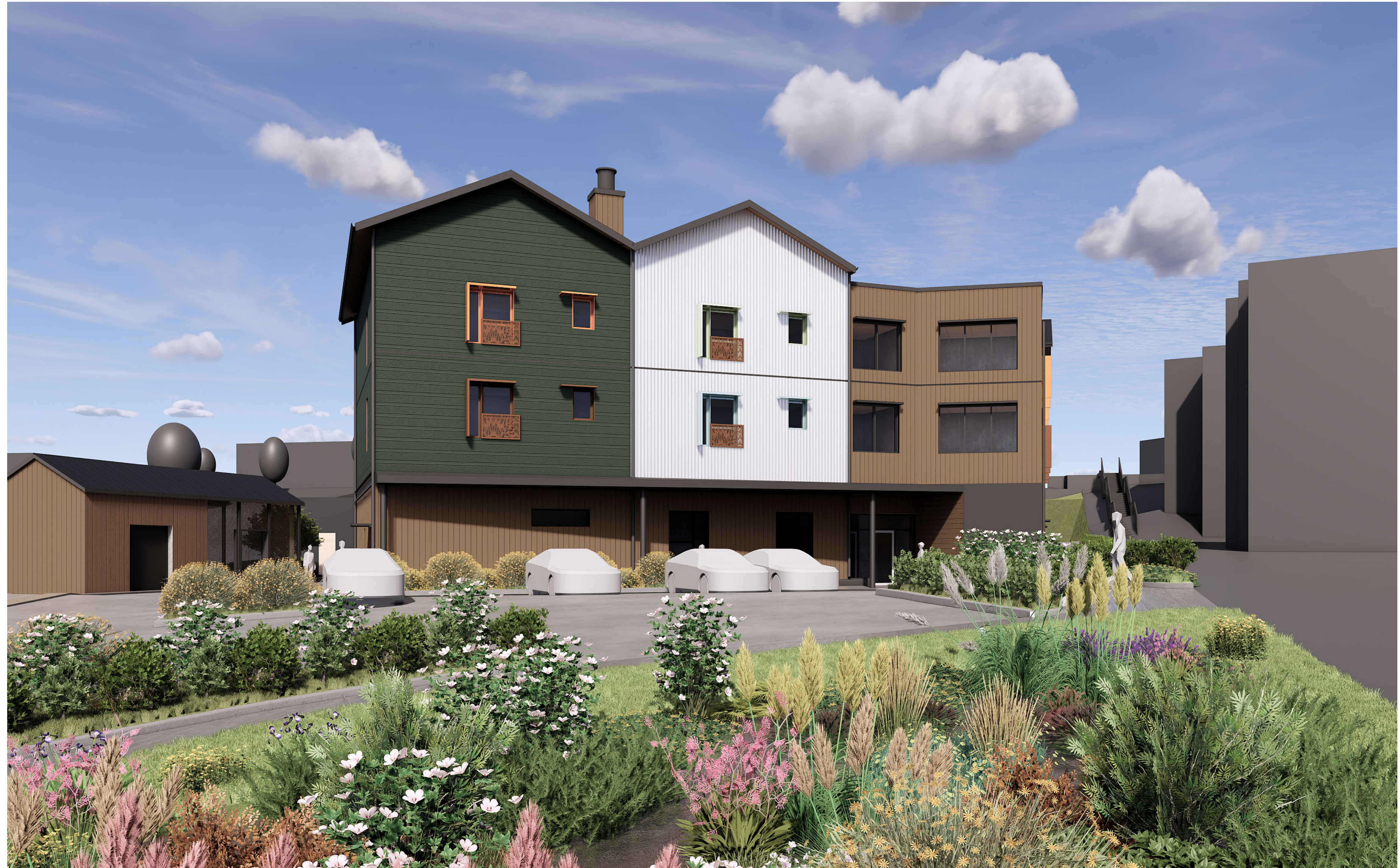
Front Entrance View

All drawings and related documents are the property of Ryder Architecture (Canada) Inc. and may not be reproduced in whole or in part without written permission. Drawings are based upon site information supplied by third parties and accuracy cannot be guaranteed. Do not scale this drawing. Do not use this drawing to calculate areas. Dimensions to be verified by the Contractor and such dimensions to be solely their responsibility. Work must comply with the relevant Building Codes, By-Laws and related documents. Drawing errors and omissions must be reported immediately to the Architect of Record.