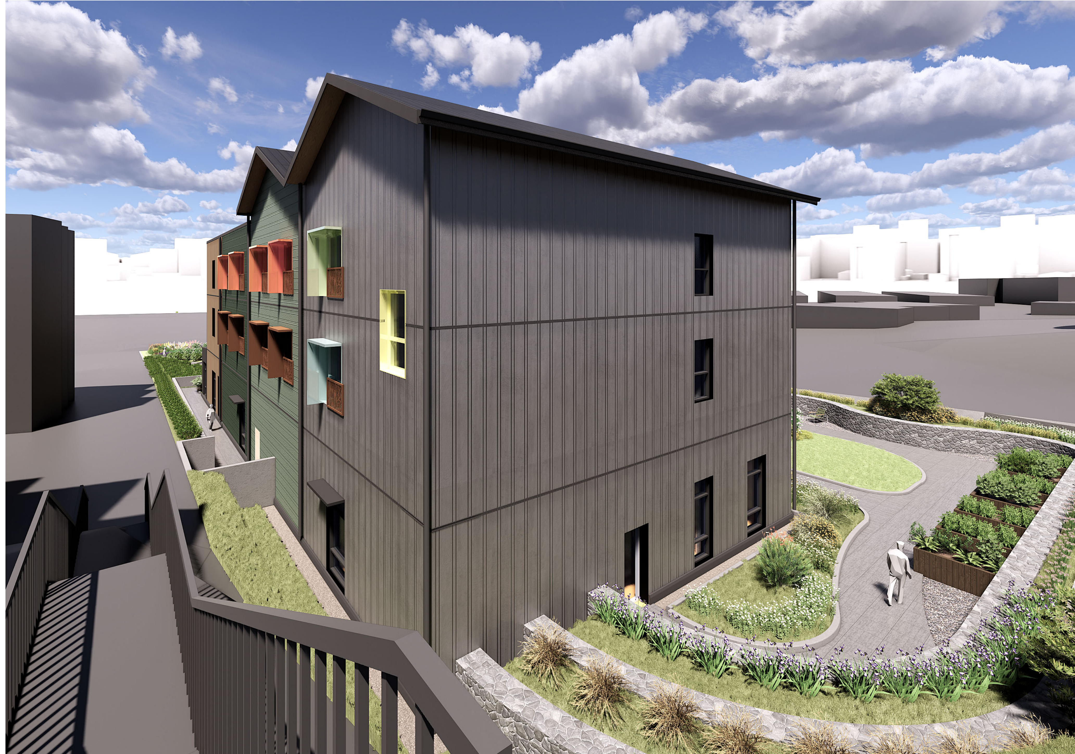
View from Retaining Wall Pedestrian Stairway

All drawings and related documents are the property of Ryder Architecture (Canada) Inc. and may not be reproduced in whole or in part without written permission. Drawings are based upon site information supplied by third parties and accuracy cannot be guaranteed. Do not scale this drawing. Do not use this drawing to calculate areas. Dimensions to be verified by the Contractor and such dimensions to be solely their responsibility. Work must comply with the relevant Building Codes, By-Laws and related documents. Drawing errors and omissions must be reported immediately to the Architect of Record.