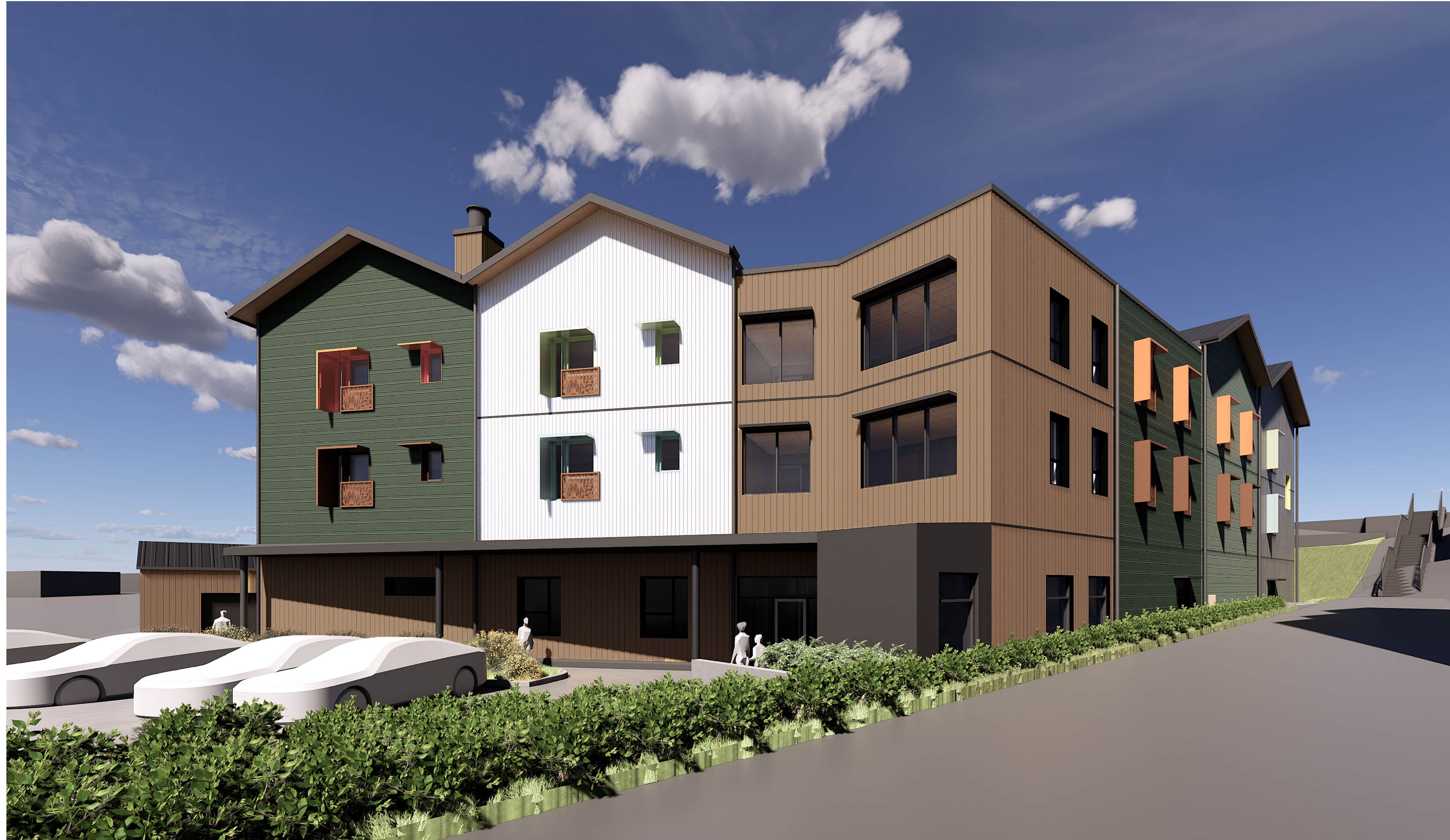
View from Pedestrian Pathway

All drawings and related documents are the property of Ryder Architecture (Canada) Inc. and may not be reproduced in whole or in part without written permission. Drawings are based upon site information supplied by third parties and accuracy cannot be guaranteed. Do not scale this drawing. Do not use this drawing to calculate areas. Dimensions to be verified by the Contractor and such dimensions to be solely their responsibility. Work must comply with the relevant Building Codes, By-Laws and related documents. Drawing errors and omissions must be reported immediately to the Architect of Record.