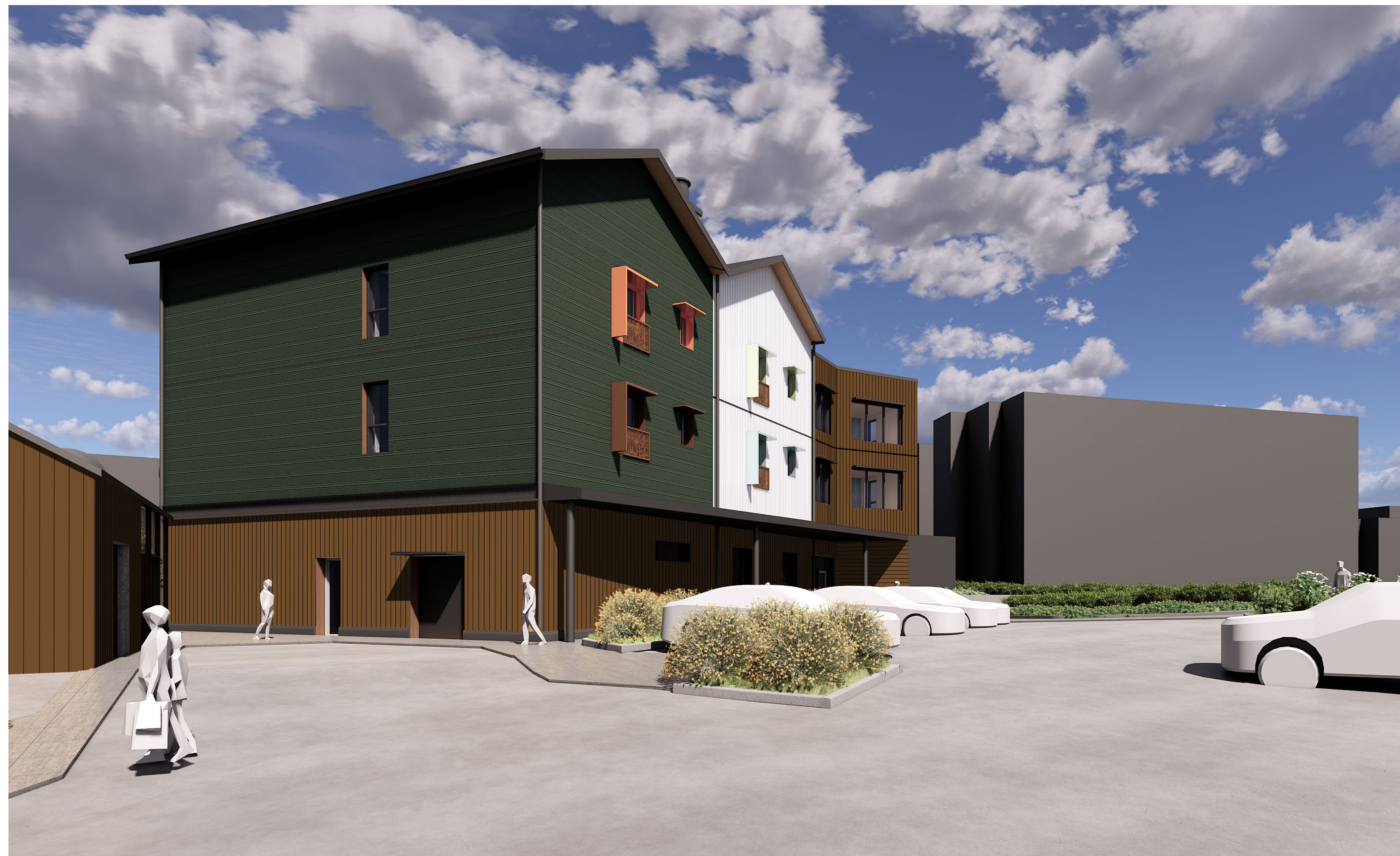
Front View from Boxwood Road